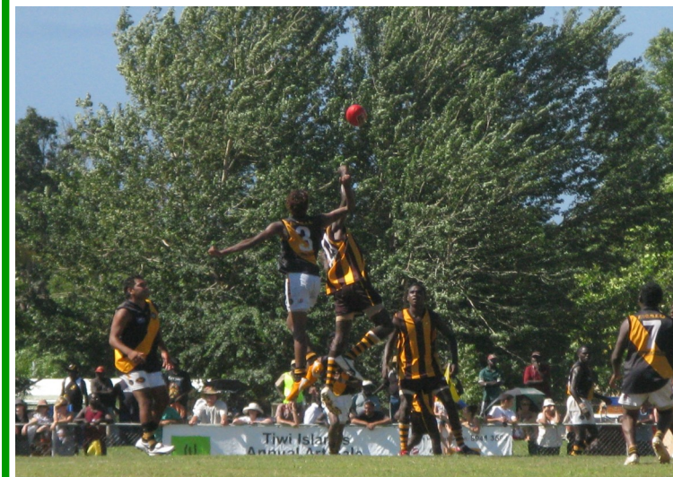
The Tiwi grand final on the 22nd March was another great day.